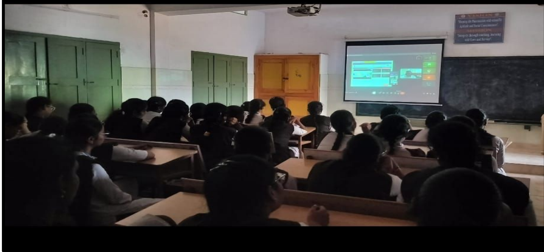
Students participating in IPR & Patent Filing Workshop