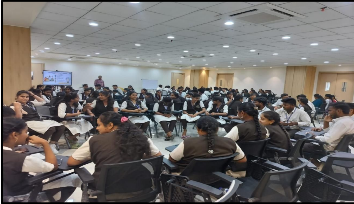
Students participating in group discussion in Ratan Tata Innovation Hub at Mayuri Tech Park